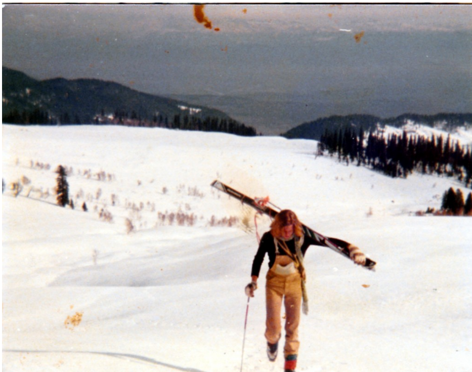
Climbing above Gulmarg, Jammu and Kashmir

Ecuador, Peru, Bolivia, Argentina and Brazil – including three weeks chugging along the rive gauche of the Amazon – and returning to Colombia. Eventually I returned to New York in July 1978 and then to London. I was still searching for some concrete direction. I wrote to Intermediate Technology Ltd., then took a job at Habitat, King's Road, until Christmas 1978 before setting off overland at the end of January 1979 towards Nepal. I must have been one of the last few travellers to follow that well-worn path, but fate smiled gently. Turkey was foul ( and fowl ) – a veritable Midnight Express but my two days passing through Iran were memorable. Most Iranians, I feel, are honest, caring people . I crossed into Afghanistan at the beginning of March. What a relief it was to reach Herat and meet the proud and strong Afghans.