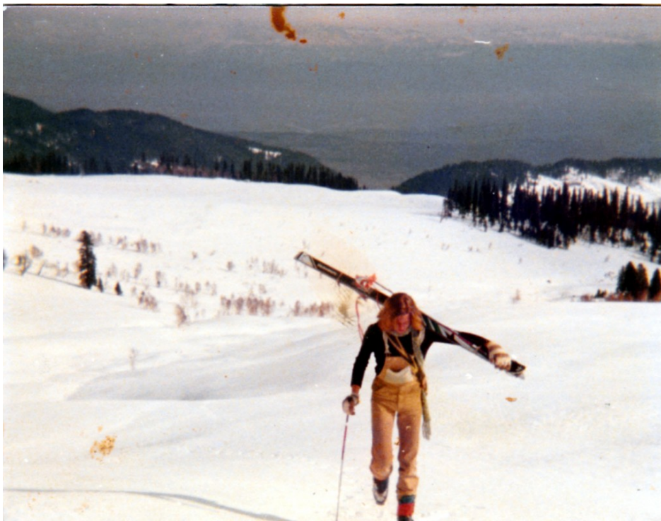
Climbing above Gulmarg, Jammu and Kashmir

Ecuador, Peru, Bolivia, Argentina and Brazil – including three weeks chugging along the rive gauche of the Amazon – and returning to Colombia. Eventually I returned to New York in July 1978 and then to London. I was still searching for some concrete direction. I wrote to Intermediate Technology Ltd., then took a job at Habitat, King's Road, until Christmas 1978 before setting off overland at the end of January 1979 towards Nepal. I must have been one of the last few travellers to follow that well-worn path, but fate smiled gently. Turkey was foul ( and fowl ) – a veritable Midnight Express but my two days passing through Iran were memorable. Most Iranians, I feel, are honest, caring people . I crossed into Afghanistan at the beginning of March. What a relief it was to reach Herat and meet the proud and strong Afghans.